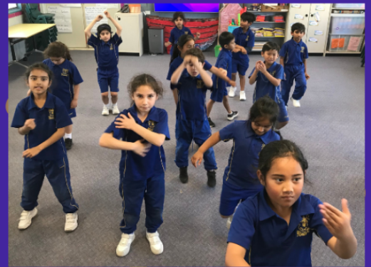
Year Two are gearing up for their "Body Boogie"