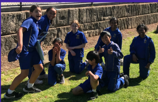
Year Five have been looking at the fun of flashmobs & may even have a surprise in store for Week Ten!