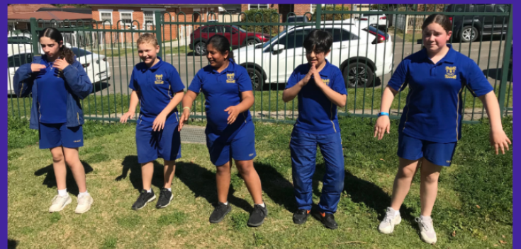
Year Six have been enjoying the opportunity to explore their own preferred style of dance & choreography

We are looking forward to putting all of this learning into action next term as the children prepare for our Christmas concert!