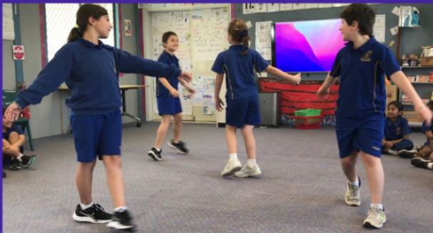
Year Three are discovering how they can tell a story through dance