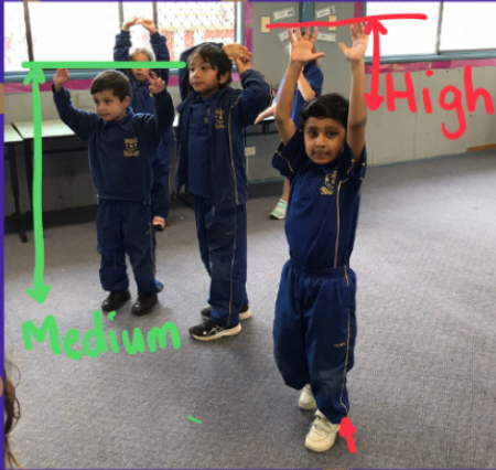
Kindergarten have been learning how their body uses different levels when they are dancing.