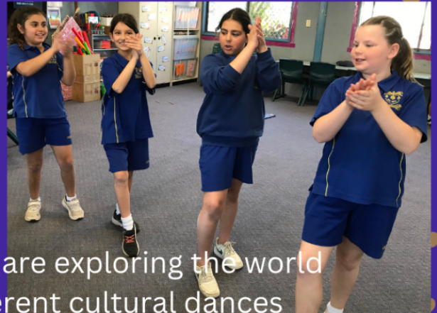
Year Four are exploring the world of different cultural dances